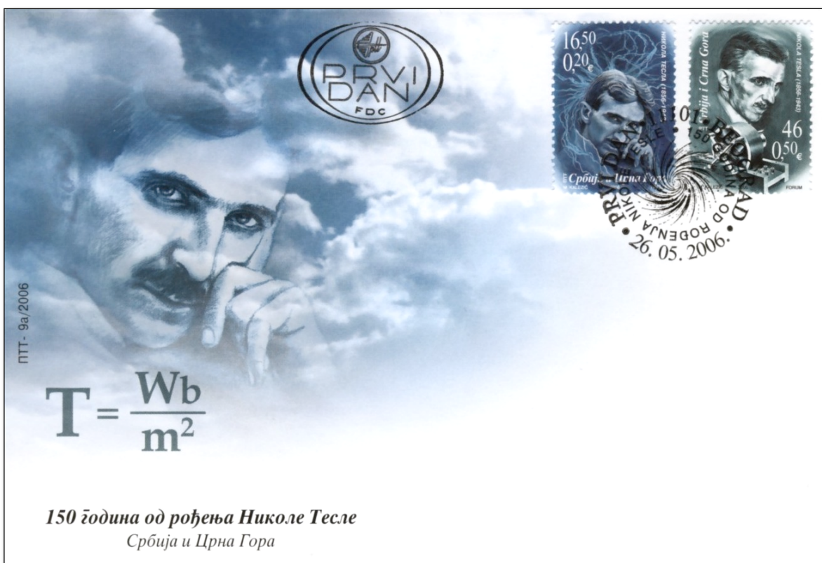
Figure 5. Nikola Tesla FDC from Serbia and Montenegro.

The same set also appears on a FDC (Figure 5). The envelope has, on the left, the portrait of Nikola Tesla (among a few clouds) and the equation: T = \text{Wb}/\text{m}^2 . On the occasion of the “Conférence Générale des Poids et Mesures”, held in Paris in 1960, the great scientist was honored with the international unit to measure the magnetic flux density. This unit, called “tesla” (symbol: T), equals to one Weber per square meter, i.e., T = \text{Wb}/\text{m}^2 .