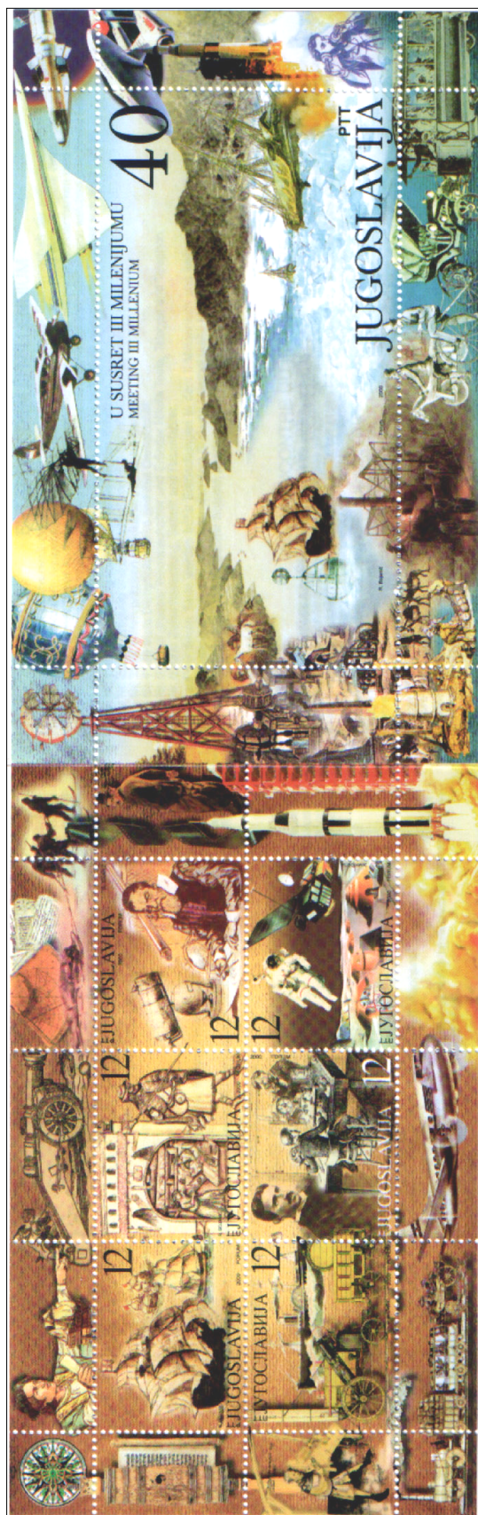
Figure 3. Nikola Tesla booklet from Yugoslavia.