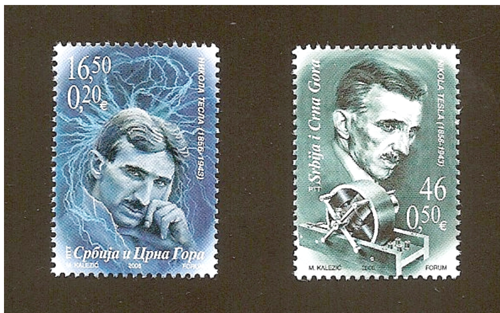
Figure 4. Nikola Tesla stamps from Serbia and Montenegro.

On 26 May 2006 Serbia & Montenegro issued many items featuring Nikola Tesla and his apparatus to celebrate the 150th anniversary of the birth of the scientist. One of those issues was a set of two stamps, illustrated here in Figure 4 below.